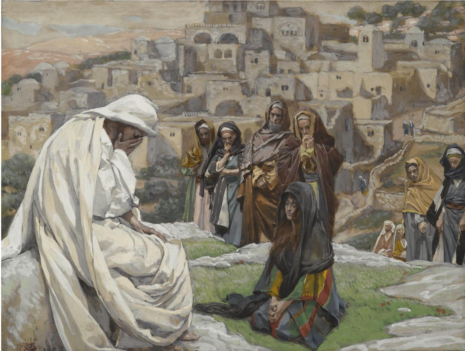
"Jesus Wept" - Tissot

First Congregational United Church of Christ September 18, 2016 10:30 am