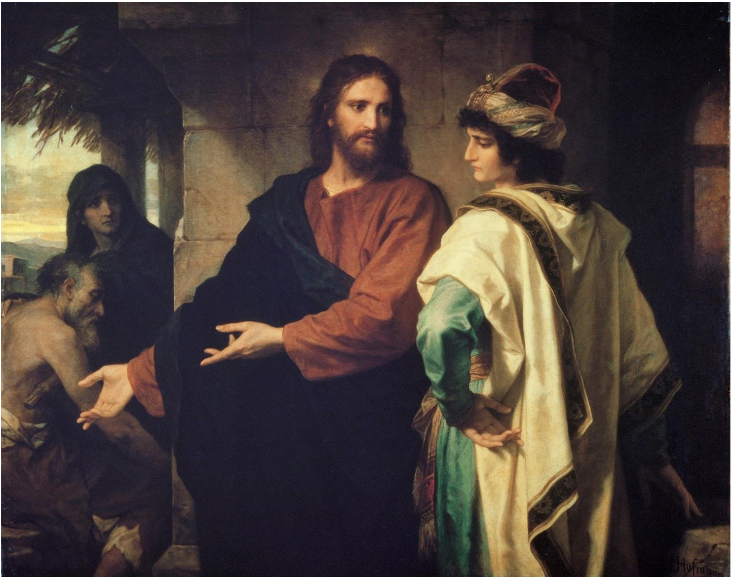
Hoffman- "Christ And The Rich Young Ruler"

First Congregational UCC is located at 20 Oak Street in downtown Asheville. Please send all mail to PO Box 3211 Asheville, NC 28802.