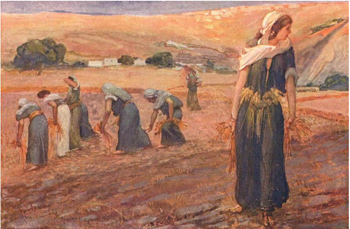
"Ruth Gleaning" James Tissot

We believe that God encourages us to engage the world through acts of mercy, peace, and justice.