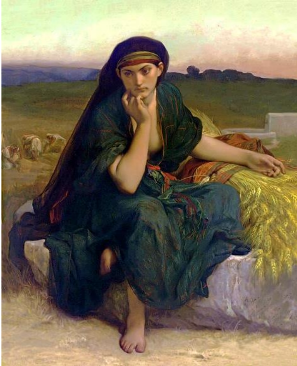
"Ruth" by Alexandre Cabanel, 1868

Season of Ordinary Time November 8, 2015 10:30 am