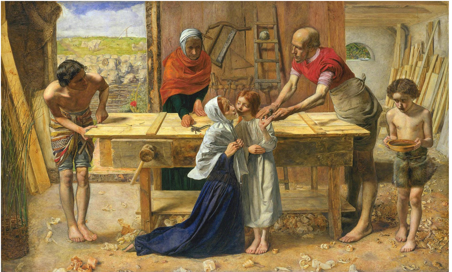
John Everett Millais, Christ in the Home of his Parents

We believe that God encourages us to engage the world through acts of mercy, peace, and justice.