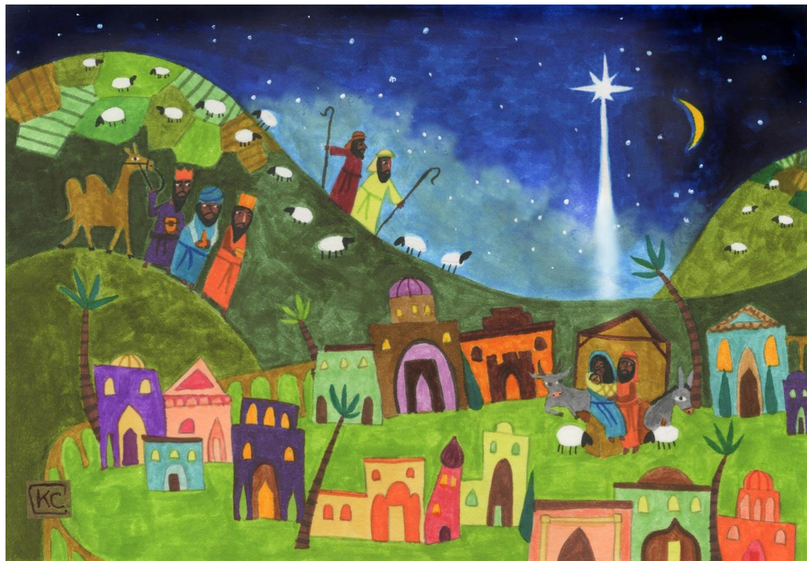
Kate Cosgrove "Mini Nativity"

Third Sunday of Advent Crèche Service Sunday, December 13, 2015 10:30 am